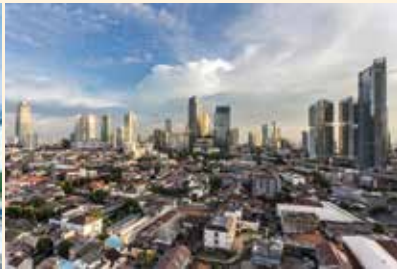
View to Menteng